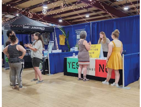
Having fun at DCRTL's 2023 Summer Picnic