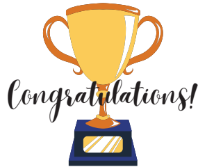
Jacey Burkle - Aquin